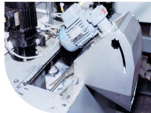
Oil skimmer with open drain / slide

Often greases & oils mixed with shavings and dirt particles as well as other highly sticky substances float up on the liquid surface. These sticky oils and greases are easily removed by the oil skimmer, but the drain often clogs after a short period of use. To remove these sticky, non-flowable contaminants quickly and easily, the oil skimmer model 1U can be used with an oil collecting pan with drain slide. Because of the steep drain angle, the sludge slides easily into a collection container. In addition, the slide is easier to clean than a pipe or hose.