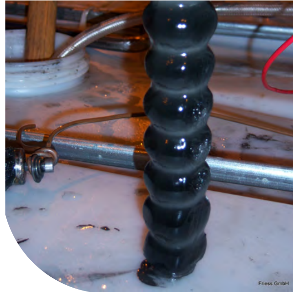
Dirt on magnetic filter rods

High temperature resistant version up to 130°C