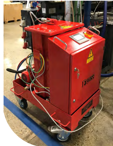
Electrostatic oil cleaner D8 in operation

The simple and safe operation of the model D8 oil cleaning system is ensured by a newly developed control system. The respective operating status is displayed on a touchscreen monitor. The system can be operated quickly and easily via convenient user guidance. The data of up to 100 hydraulic systems can be stored in the control system. Based on the stored oil volume and oil type, the system automatically calculates the required cleaning time. After the cleaning is finished, this is shown on the display and the system can be connected to the next hydraulic system. All data are stored even after the cleaning system is switched off, so that after a standstill, work continues with the previously determined data. For safe continuous operation, the system is equipped with an oil collecting tray and an automatic shutdown in case of possible oil loss. All functions are continuously monitored with safety switches and sensors.