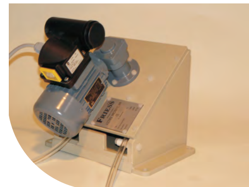
Oil skimmer 1U plastic version

Already the standard version of the oil skimmer model 1U is made of corrosion-resistant stainless steel 1.4301 (AISI 304) and ceramics. Especially for the food and chemical industry, the oil skimmer model 1U is available in materials such as 1.4571 or 1.4404 (AISI 316). For use in pickling baths or fluids containing chloride, the Model 1U oil skimmer is also offered in an all-plastic version.