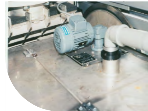
Built in oil skimmer 1U

Many tanks are closed for various reasons such as odor, heat loss, etc. To remove oil from the bath surface, a section of the tank would have to remain open. The oil skimmer model 1U built-in version can be placed like a lid on a corresponding cut-out in the tank cover. The oil skimmer can thus operate while the tank remains completely closed. Other installation versions for a closed tank, such as a flange connection are also available.