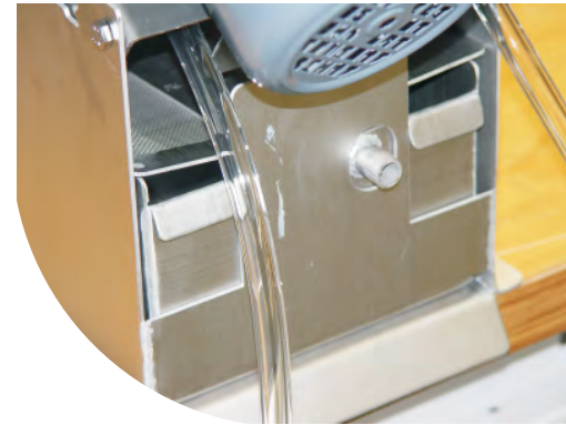
Oil skimmer 1U with oil separator

Especially in degreasing systems, the bath surface must be free of floating oils to ensure optimum cleanliness of the surfaces of the parts to be washed. The oil skimmer must therefore constantly remove the floating oil phase. Since the floating oil layer is often very thin, a certain amount of washing water is removed with the oil. The wash water settles in the integrated separator and is returned to the working tank, while the oil drains off in a collection tank. The discharge of wash water is reduced and the amount of used oil to be disposed of is reduced.